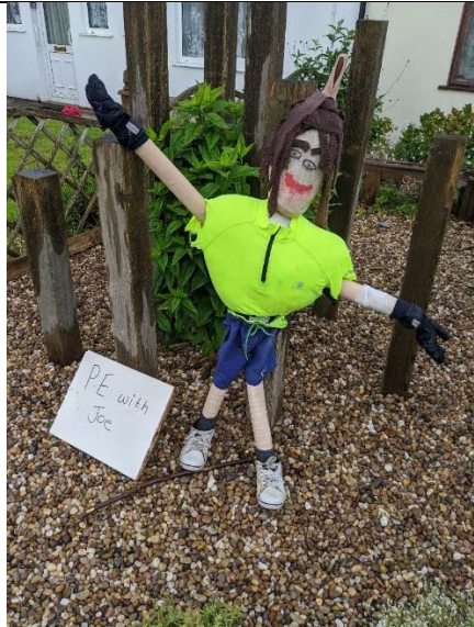
Maes Y Felin