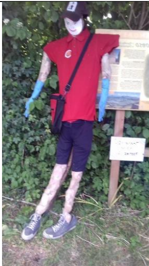
Entrance to Llangorse Youth & Community