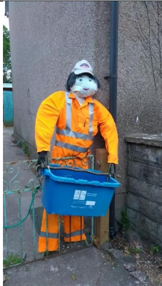
Main road, before triangle