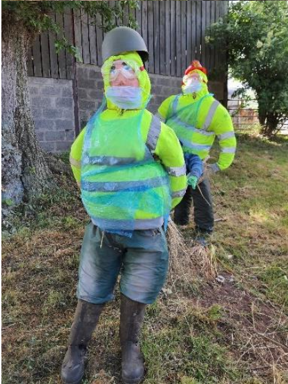
Lower Cefn Farm, take the fork left just before the turning for Tai Canol and keep going!

Ta da! 27 entries – DIOLCH YN FAWR ALL! These have certainly bought so many smiles to those who have seen them! Thank you so much for taking part.