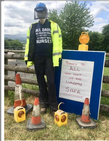
Tyr Cwm, Gilfach