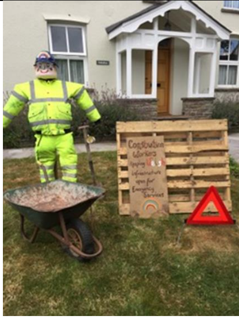
Llyn Safaddan – just along from

If he could come and sort our garden, we'd be really grateful!