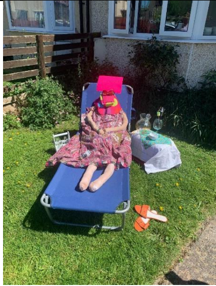
On Maes y Felin

She looks like she's having a fab time relaxing! We're jealous!!