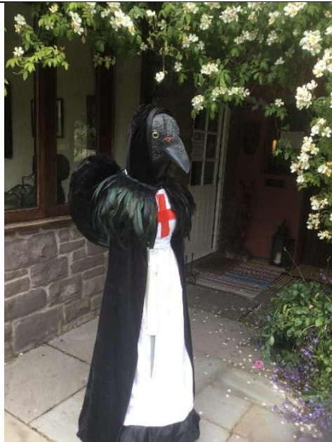
Pen Y Bryn House, just past