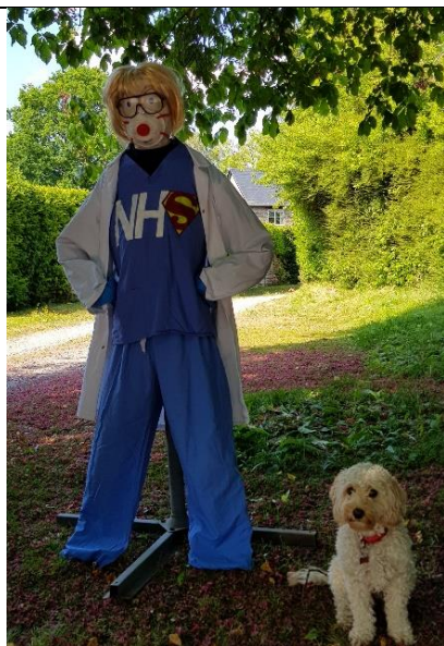
under the tree