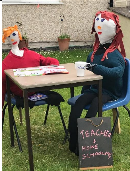
Maes y Felin

A student who looks like their enjoying school!!!